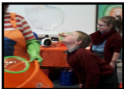
Science week in Ferrybank Library