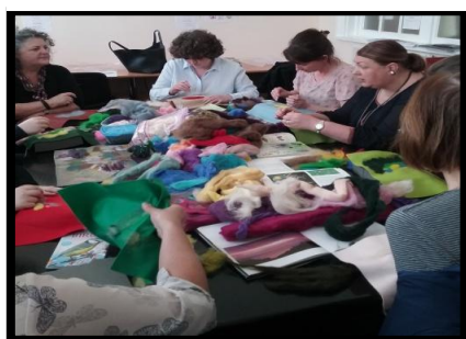
2D Felting during Bealtaine in City Library