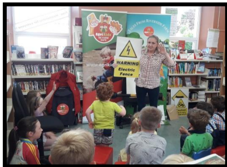
Agrikids Farm safety Workshop in Callan Library, in association with Glanbia Agribusiness.