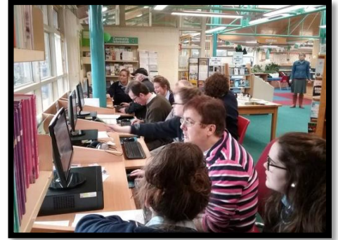
Duiske College IT classes through Action in Graig Library