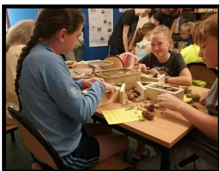
Insect hotel making during Cruinniú na nÓg in Thomastown library