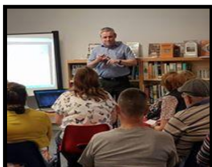
Family History Resources in Loughboy