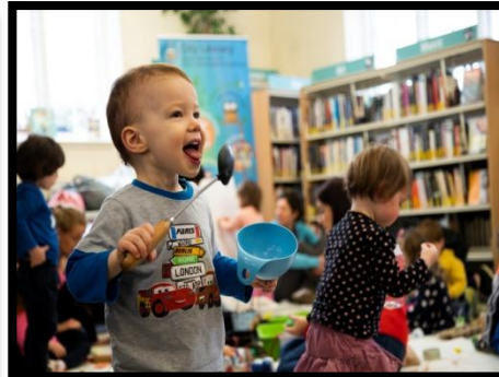
Messy Play Workshop during Bookville in City Library