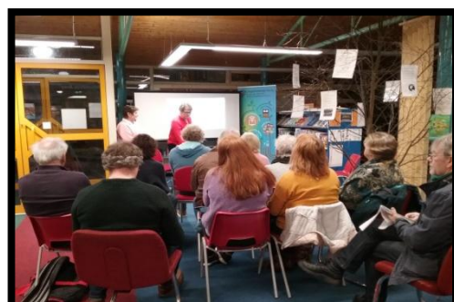
Living with dementia Talk in Graiguenamanagh