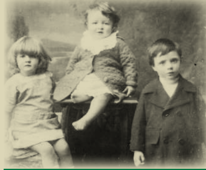
The Treacy family