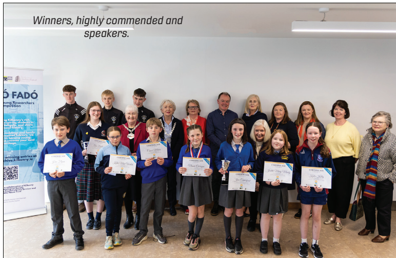
Winners, highly commended and speakers.