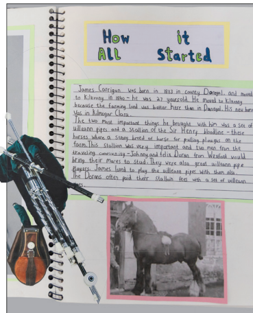
The history of Carrigan Uilleann pipes 1840-2026